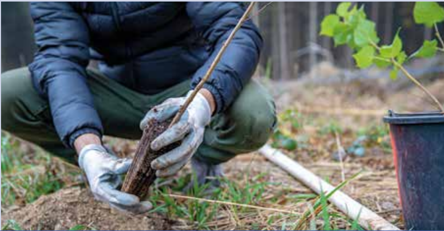
Tree restoration within the Valley