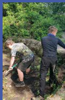
Two of the team getting stuck in to some hard graft