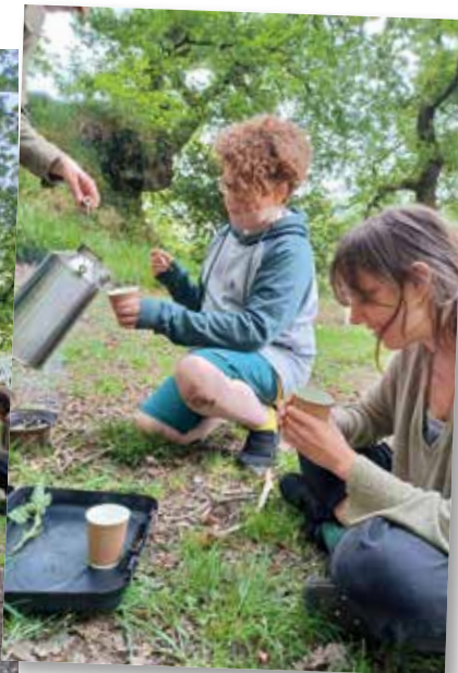
Above: Foraging walk activities

Activities planned include farm visits, water quality investigations, litter picks and practical conservation work. In May, the group enjoyed their first session with a foraging walk run by Incredible Edible using local footpaths in Bere Alston.