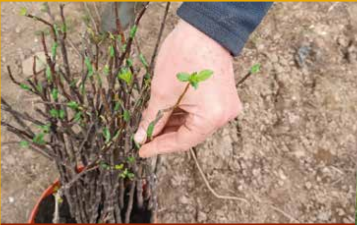
Above left: Apple tree grafts ready for planting at Facey's Meadow Above right: New hedge planting at Clamoak Orchard