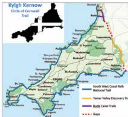
Above: Cornish Trails route map

Partnership Scheme, including Cornwall Council and Devon County Council have worked together with the help of external consultants Countryside Creation Services to develop the proposal.