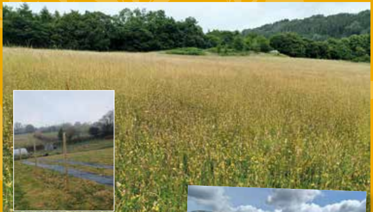
Above left: Species rich wildflower meadow at Harewood Farm (Inset) Deer fencing Right: View across South Hooe