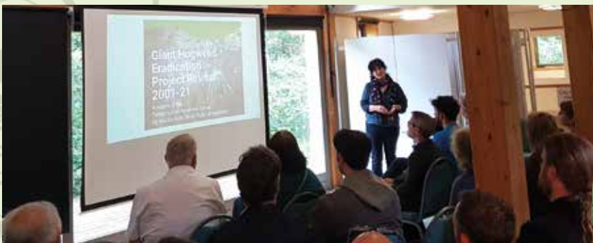
Tamar Valley Centre, May 2022 - landowners, the general public and local organisations met to learn about the giant hogweed project. This event was held in partnership with South West Lakes Trust and South West Water.