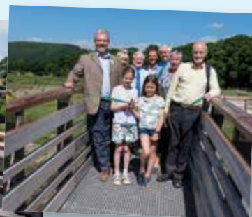
Above: Calstock School pupils and staff cutting the ribbon