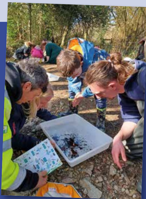
Above: Event at Buckland Monachorum

We've also been working with the Trust to launch the school element of this project. This aims to equip teachers with the knowledge and confidence to take pupils to their local watercourses to carry out surveys to look for aquatic life and find out more about the CSI scheme. Our first pilot session with Calstock Primary and Callington Community College launched in May. We're still looking for local secondary and SEN schools to be involved, so please do get in touch.