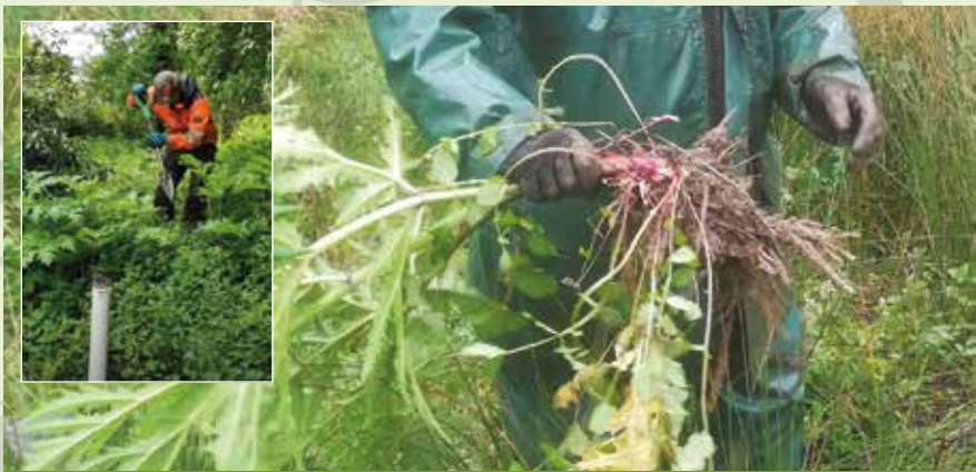
Above: Digging up giant hogweed to remove tap root (Inset) Essential use of specialist contractors