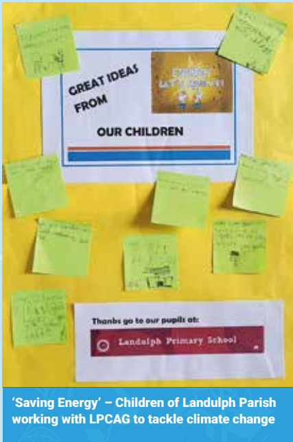
'Saving Energy' – Children of Landulph Parish working with LPCAG to tackle climate change