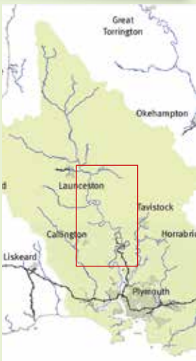
The Tamar Valley catchment ( Map copied from Tamar Catchment Flood Management Plan 2012)