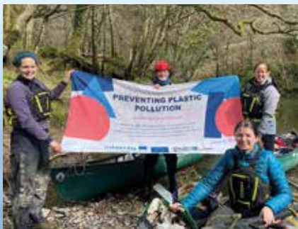
A Preventing Plastic Pollution litter pick on the River Tamar with Plymouth University lecturers

The WRT PPP team will also be running litter picks for members of the public to get involved in throughout the rest of the year – follow WRT on Facebook (@WestcountryRivers), Twitter (@WestcountryRT) and Instagram (@westcountryrivers) to stay up to date with the latest PPP events.