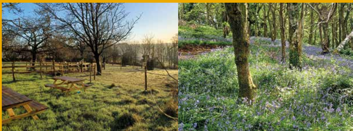
Above left: Bohetherick Farm visitor area, St Dominic