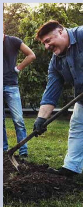
Above: Helping to keep the Tamar Valley special