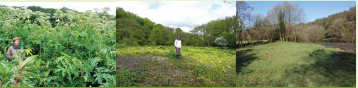
Above: A heavily infested site near Gunnislake in 2005, with some regrowth visible in 2009 and finally clear of giant hogweed in 2012

the essential use of boats in some locations. The importance of finding and retaining good contractors is also highlighted.