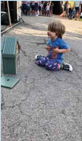
(Above) Bug hotel prize for the winner of our Nature Trail!