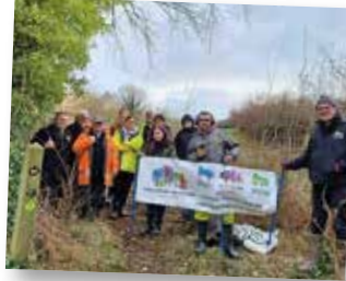
Above: Battling On

We've been working in partnership with Battling On, delivering outdoor sessions for young people and adults with partners such as local farms, community interest companies and Westcountry Rivers Trust. These sessions have focused on engaging people with nature and their local landscape, running activities such as butterfly habitat creation, footpath maintenance, litter picks, orchard care and water quality surveys.