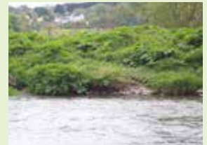
Giant hogweed infesting a riverbank

The review concludes with recommendations to help take the project forward into a 'maintenance' phase to ensure the positive outcome is not reversed. Key among these are to continue to develop and expand the communication network with landowners and other river users, and to retain a budget to enable quick action to be taken should any new giant hogweed plants be discovered.