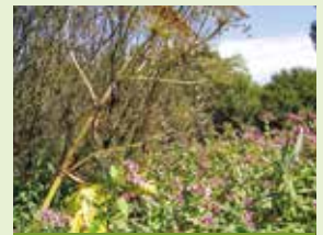
Mixed stand of giant hogweed and Himalayan balsam