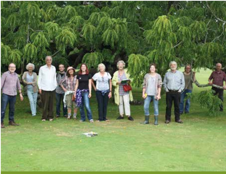
Helping Hands for Heritage visit to Antony House 2014