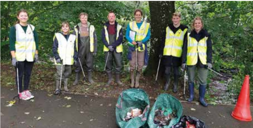
A Preventing Plastic Pollution litter pick carried out with volunteers from Plymouth City Council, Plymouth University and Queen Mary University on the River Tavy

Tamar-based businesses can help to protect the River Tamar by accessing free plastic waste audits from environmental charity, Westcountry Rivers Trust.