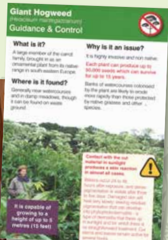
Giant hogweed guidance and control leaflet