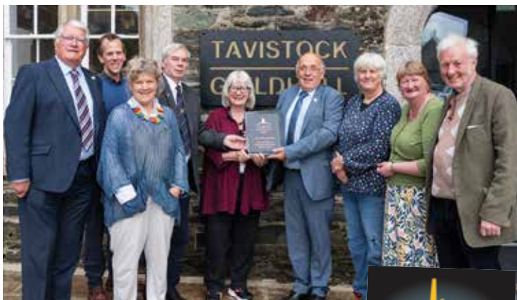
Tavistock Guildhall WHS Key Centre Presentation