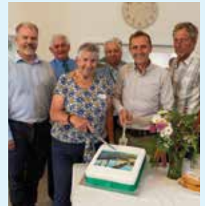
Above: Specially-commissioned cake celebrating the walkway and wetland