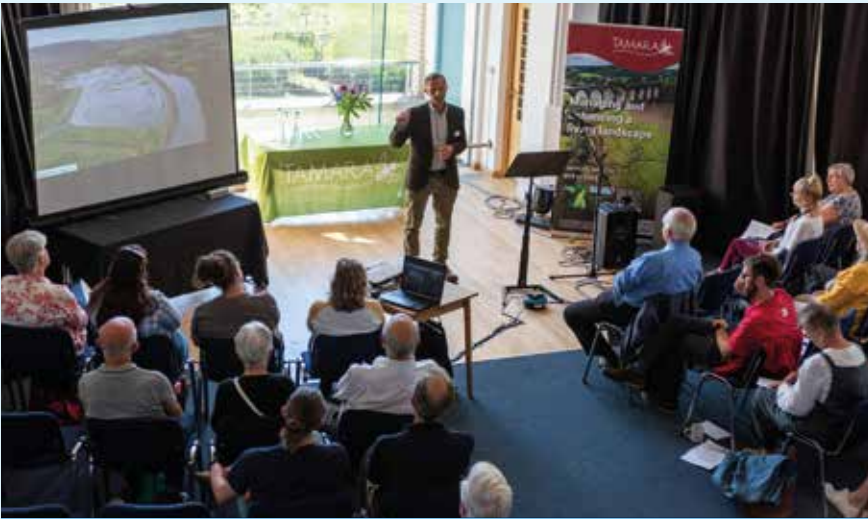
Above: One of several inspirational talks at the Annual Forum