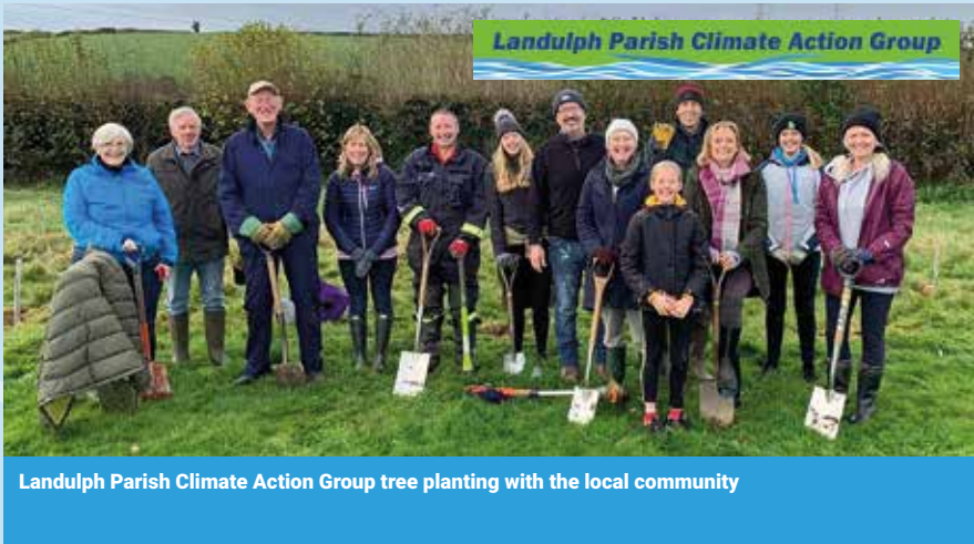
Landulph Parish Climate Action Group tree planting with the local community

The Landulph Parish Climate Action Group (LPCAG) is a community-led initiative based in the heart of the Tamar Valley AONB. It is actively working alongside the local community to tackle some of the very real challenges posed by climate change.